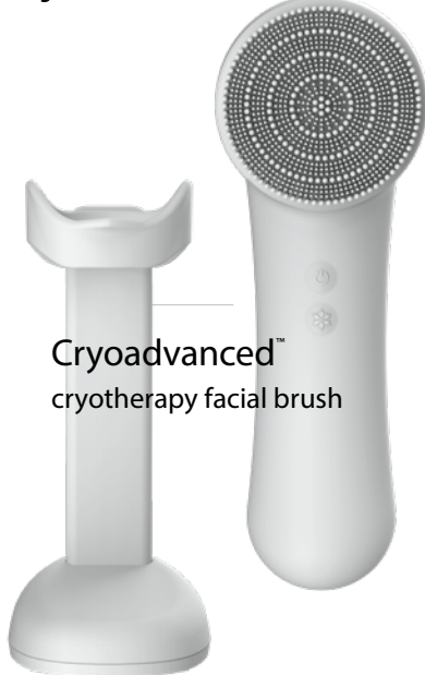
Cryoadvanced™ cryotherapy facial brush

Please register this product at register.conair.com